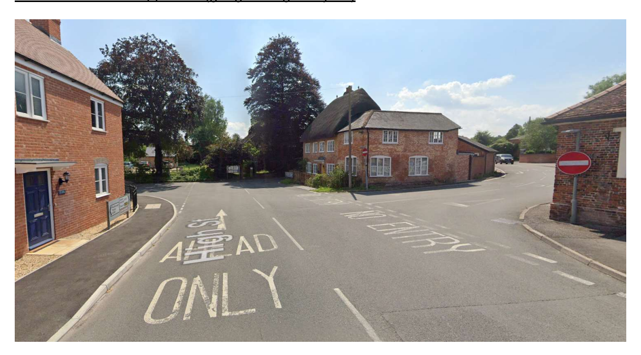
A342 Westbound approach Andover Road (google image July 21)

A345 Southbound approach (google image July 21)